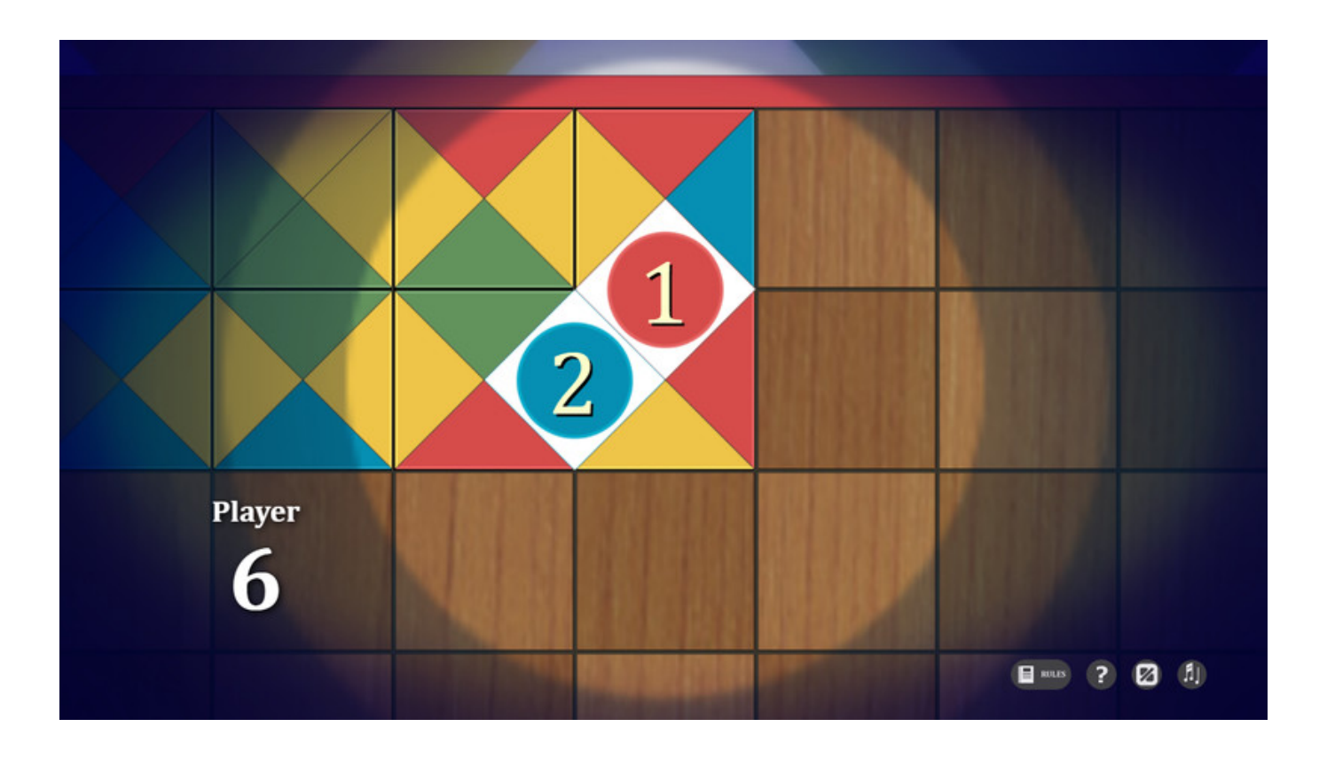
Download ->>> http://bit.lv/2SJeXre